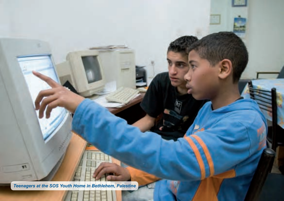
Teenagers at the SOS Youth Home in Bethlehem, Palestine