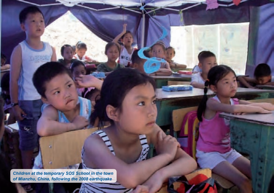
Children at the temporary SOS School in the town of Mianzhu, China, following the 2008 earthquake