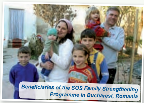
Beneficiaries of the SOS Family Strengthening Programme in Bucharest, Romania

Unlike many other international NGOs, SOS Children is run by local people with a specific knowledge and understanding of their region. They are, therefore, directly responsible for the development of their own communities.