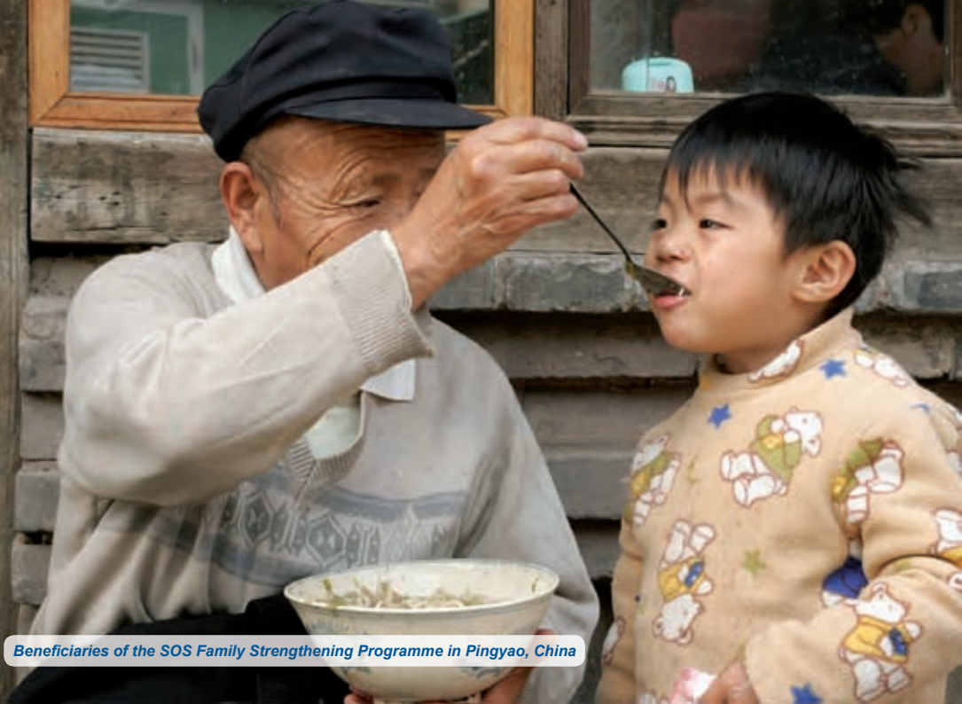
Beneficiaries of the SOS Family Strengthening Programme in Pingyao, China