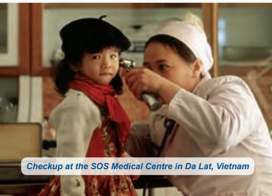
Checkup at the SOS Medical Centre in Da Lat, Vietnam