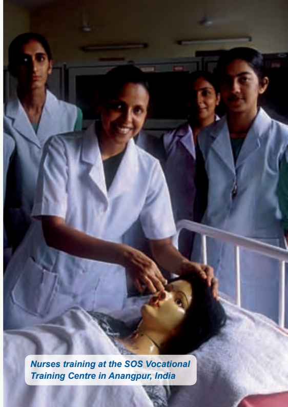
Nurses training at the SOS Vocational Training Centre in Anangpur, India