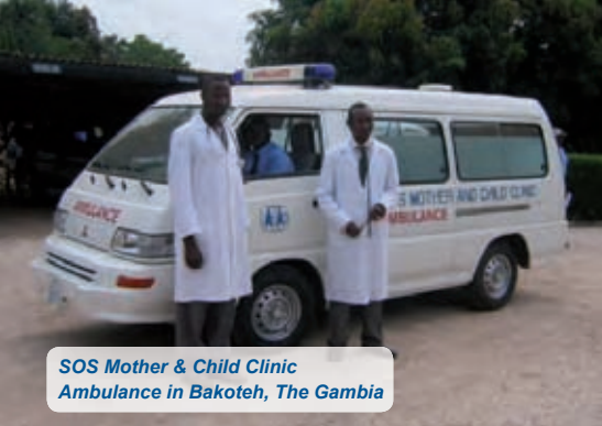
SOS Mother & Child Clinic Ambulance in Bakoteh, The Gambia