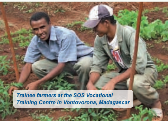
Trainee farmers at the SOS Vocational Training Centre in Vontovorona, Madagascar