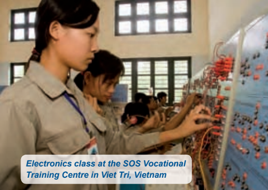
Electronics class at the SOS Vocational Training Centre in Viet Tri, Vietnam