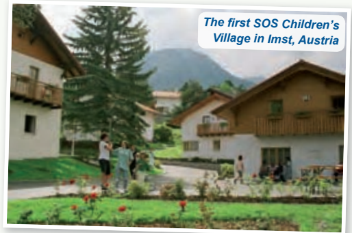
The first SOS Children's Village in Imst, Austria

SOS mothers and families are guided and supported by the Village Director, while SOS aunts help out with childcare responsibilities and daily life in the Village.