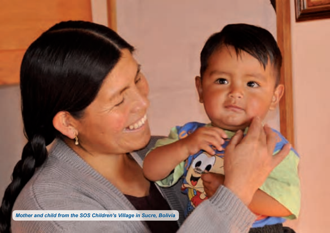
Mother and child from the SOS Children's Village in Sucre, Bolivia