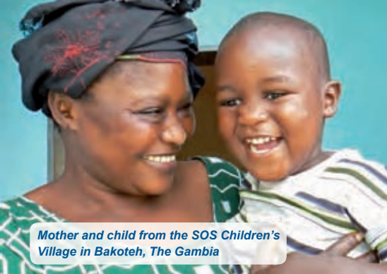
Mother and child from the SOS Children's Village in Bakoteh, The Gambia