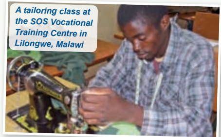
A tailoring class at the SOS Vocational Training Centre in Lilongwe, Malawi

those with disabilities, a practical education. Currently 63% of the students are girls. Courses available include: IT, agriculture, electrical appliance repair, metalwork, home economics, textiles and construction. The students are also trained in commercial awareness to help them apply their skills effectively.