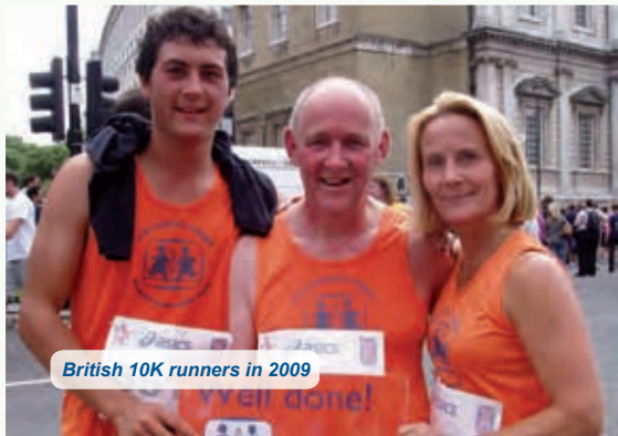
British 10K runners in 2009