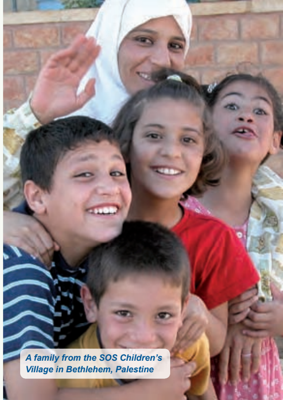
A family from the SOS Children's Village in Bethlehem, Palestine