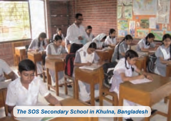
The SOS Secondary School in Khulna, Bangladesh