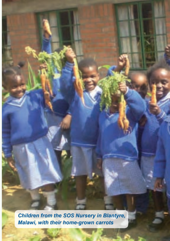
Children from the SOS Nursery in Blantyre, Malawi, with their home-grown carrots