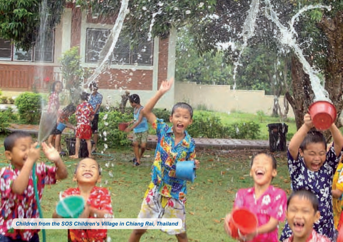
Children from the SOS Children's Village in Chiang Rai, Thailand