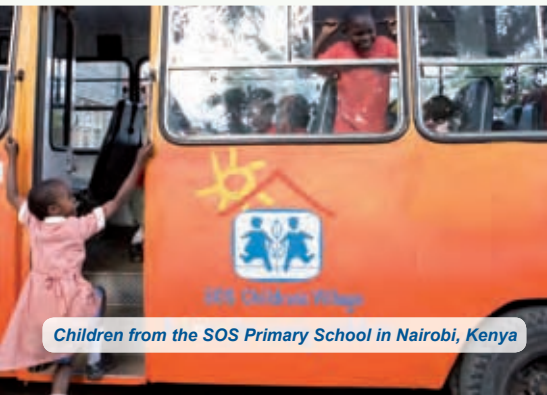
Children from the SOS Primary School in Nairobi, Kenya