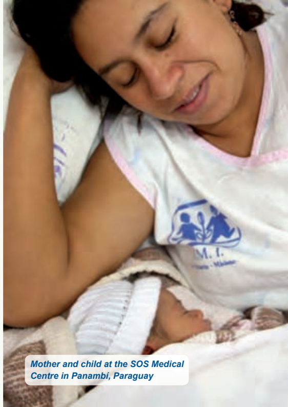
Mother and child at the SOS Medical Centre in Panambi, Paraguay