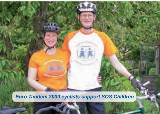
Euro Tandem 2009 cyclists support SOS Children