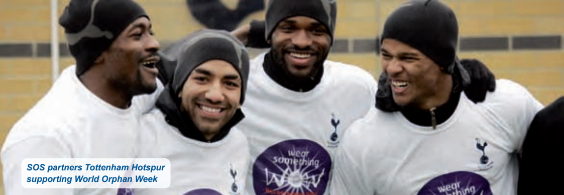
SOS partners Tottenham Hotspur supporting World Orphan Week