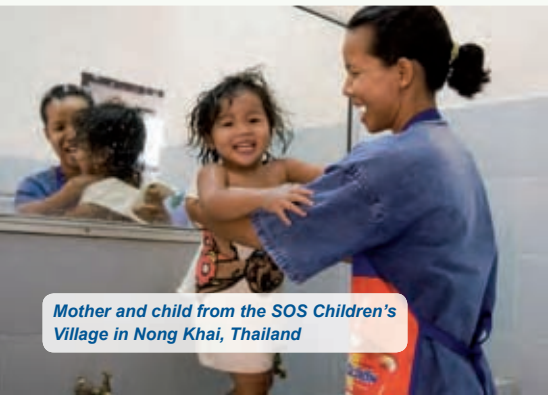
Mother and child from the SOS Children's Village in Nong Khai, Thailand