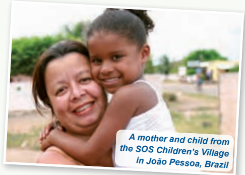
A mother and child from the SOS Children's Village in João Pessoa, Brazil

Natural brothers and sisters are never separated and children stay within the same SOS family, building ties that last a lifetime - just like any family.