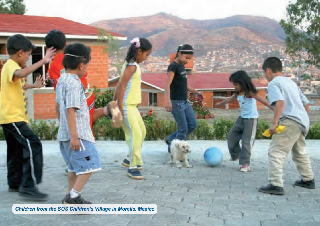
Children from the SOS Children's Village in Morelia, Mexico